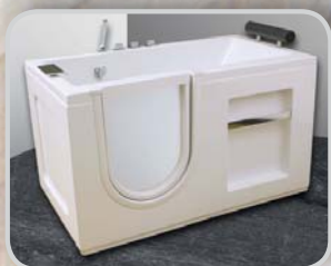
105 series model