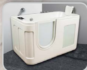
103 series model