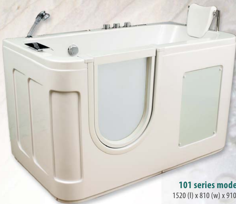
101 series model