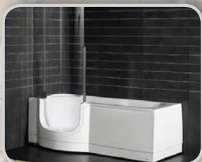
300 series model